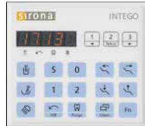
EasyPad Clear and intuitive user interface.

INTEGO gives you the ideal workflow for your daily processes. is an extremely reliable partner for your practice.