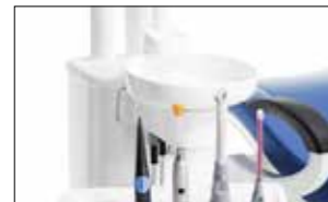
Assistant Element: Compact The assistant element is very compact and ensures maximum freedom of movement. With the Compact model, you can work comfortably with an assistant.