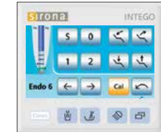
ApexLocator Can be integrated into the EasyTouch to allow permanent control of the working depth during endodontic treatment.