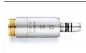
Integrated torque control The motor stops automatically when the set maximum torque is reached. This ensures greater safety and a perfect workflow for endodontics treatment.