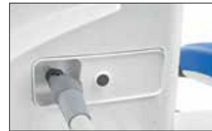
Automatic suction hose cleaning Cleaning adaptor for automatic purging of saliva ejector and spray aspirator.