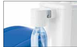
Fresh water bottle For controlled water quality. Can also be filled with DENTOSEPT solution for permanent disinfection and manual sanitization.