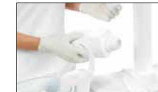
Integrated disinfection system Permanent disinfection of all water lines with DENTOSEPT. Automatic sanitizing function for regular intensive disinfection.