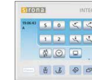
EasyTouch More operating comfort thanks to intuitive touchscreen technology and more operating and display options.

INTEGO pro gives you even more choice: All your requirements are covered thanks to the additional innovative operating and hygiene equipment options.