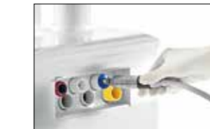
Integrated cleaning adapter For automatic purging of instrument hoses (AutoPurge) and sanitization of the water lines.