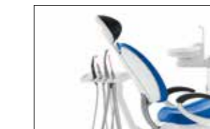
Assistant Element: Comfort The assistant element is very compact and ensure maximum freedom of movement. You can work comfortably even without an assistant.